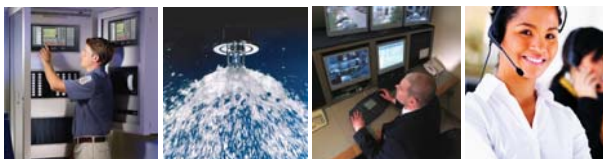
fire alarm sprinkler security monitoring

Shaping the future of life safety. We are SimplexGrinnell.